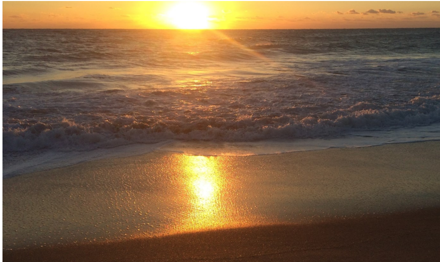
Sunrise at St Simons Island, April 2017